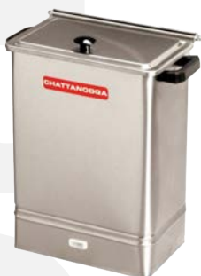
E1 4 PACKS