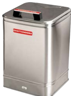
E1 6 PACKS