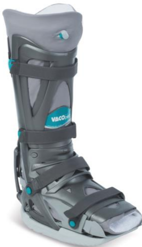
Figure 1. VACOPed boot