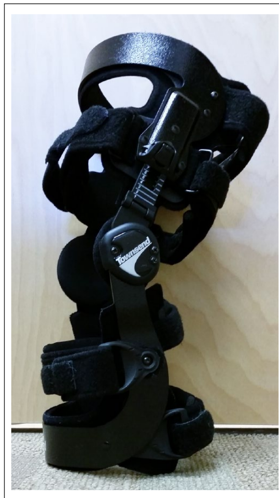
Figure 1. Picture of the Townsend Rebel Reliever brace.

Participants with diagnosed knee OA between the ages of 35 and 70 years were recruited to participate. Inclusion criteria were unilateral, medial compartment OA of the knee diagnosed by an orthopedic physician and classified on the Kellgren–Lawrence scale. Specific exclusion criteria included cardiac or pulmonary disease that limits ability to walk; presence of hip, ankle, foot, or contralateral knee OA; surgical procedure in either leg within the past 6 months; or the presence of other lower limb pathology that limits the ability to walk. All participants received a prescription for the brace and provided