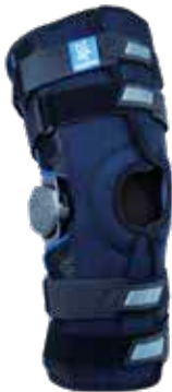
OPEN LONG VERSION

Available in short (30 cm) and long version (40 cm), in open and closed design