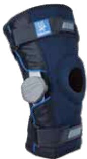
CLOSED SHORT VERSION

Choose the appropriate size to fit the patient, referring to the size chart. If the measurements taken do not correspond to the same size, favor the size corresponding to measurement A.